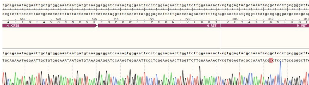
Figure 2 | The KIF5B-RET mutation analysis by Sanger sequencing.